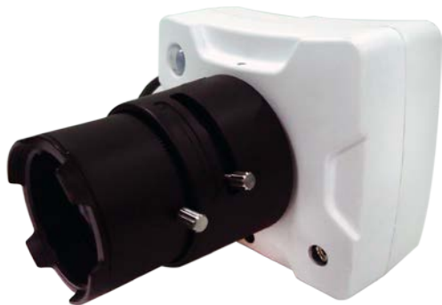
( Lens is not included)

Good quality, adequate function, and just fit my budget! – These are the wishes of every user. A-MTK Gallery View product line is designed to fulfill the need. With great imaging technology and complete interface, user can build up a reliable surveillance environment.